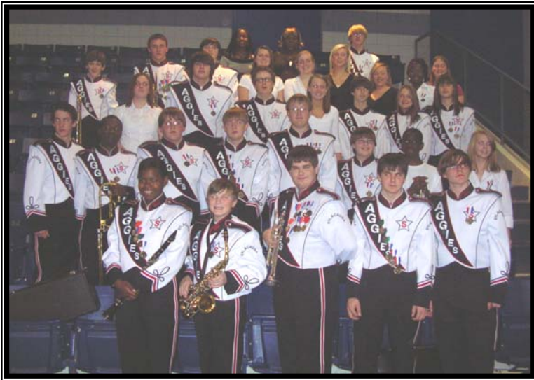
All County Band March 2007